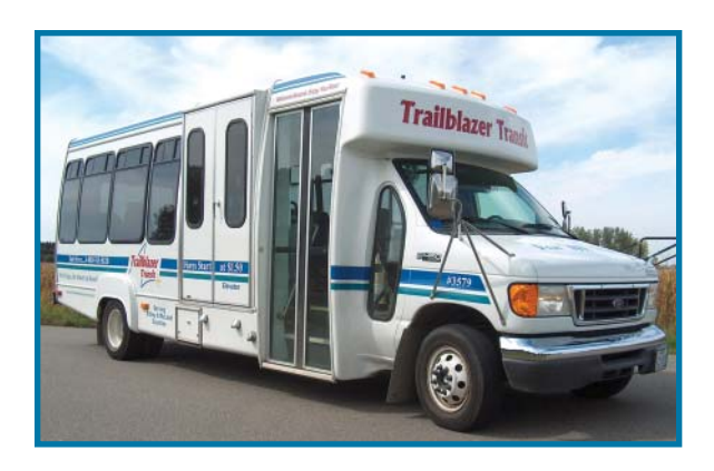
Serving Sibley & McLeod Counties