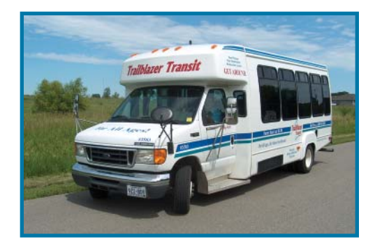
Sponsored by the Minnesota Department of Transportation

Your Pickup. Your Destination. Kinda Like A Limo. GET AROUND. 1-888-743-3828