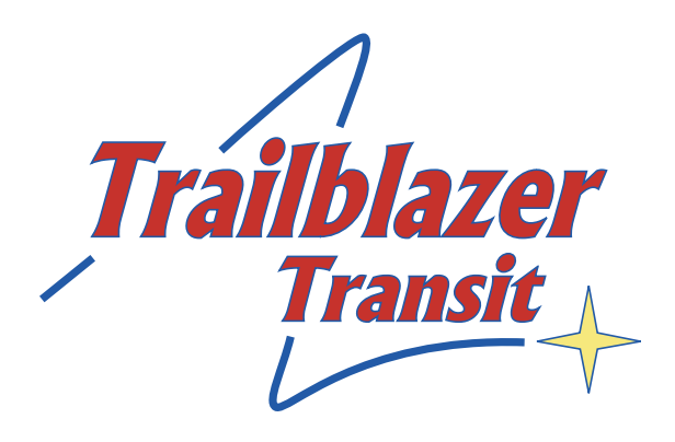
For All Ages... For Almost Any Reason!

For more information, please see our web site. www.TrailblazerTransit.com